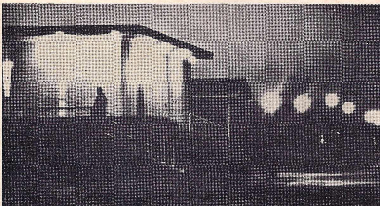
The New Science Building

The athletic program is growing at Harford along with the academic and physical growth of the institution. This year, for example, is the first year for Harford's football team. We wish our neighbors at Harford Junior College best of luck with their 1966-67 football season.