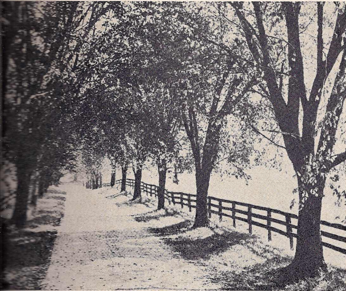
A Tree-Covered Campus Road

A two year school, Harford Junior College provides both a day and evening program with a variety of courses ranging from art to physics to the local community. Successful graduates are eligible for transfer to a senior institution where they may complete requirements for a baccalaureate degree. In addition to the long range program, the philosophy of Harford Junior College provides service for educating individuals who wish training and background for employment in technical and business fields at a semi-professional level.