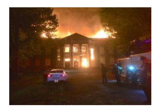
Memorial Hall September 21, 2014

Oh, better that her shattered hulk Should fall beneath the flames. Her students sailed the mighty deep; Remember well their names.